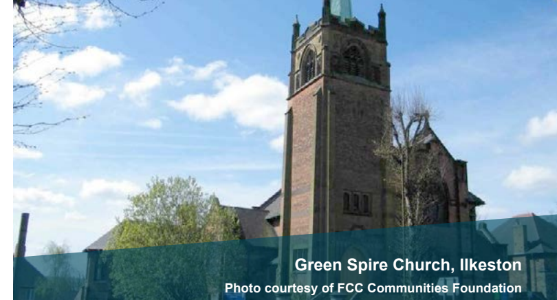
Green Spire Church, Ilkeston

Front cover images (clockwise from top left): Manton Jubilee Field Community Outdoors, image courtesy of Community First; St Thomas a Becket Church, image courtesy of Mick George Community Fund administered by Grantscape; Charteris Community Centre, image courtesy of Augean Community Fund administered by Grantscape; Delamere Beaver Project, Cheshire Wildlife Trust funded by Biffa Award image courtesy of Rachel Bradshaw