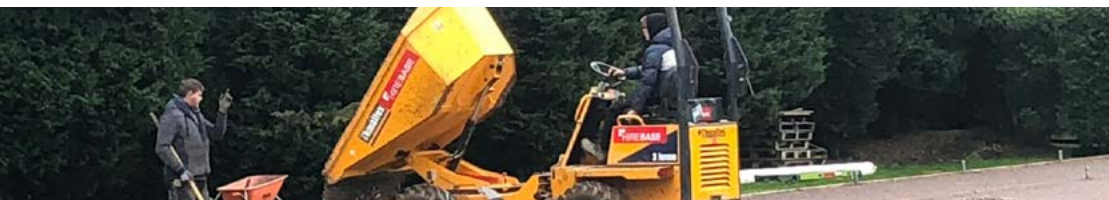
Practice Net Restoration project, West Bromwich Dartmouth Cricket Club (WBDC)